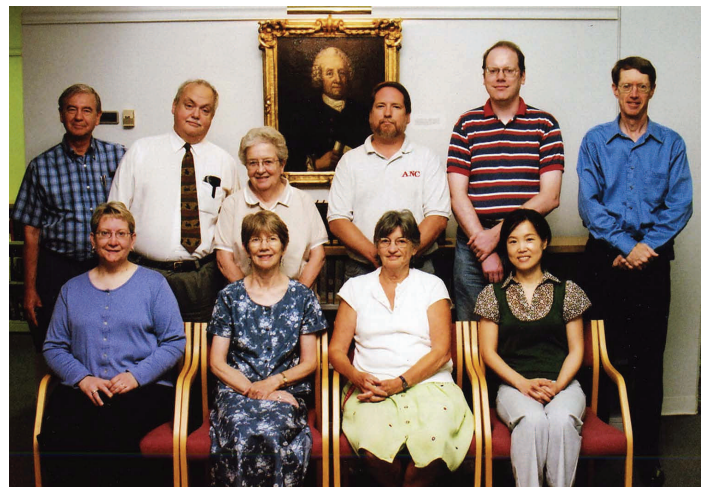
Swedenborg Library Staff