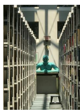
"Midday with Sandburg, in the stacks."