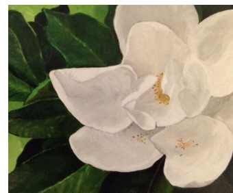
"Magnolias" by Debra Lermitté

The paintings will be on display in the Library until May 27.