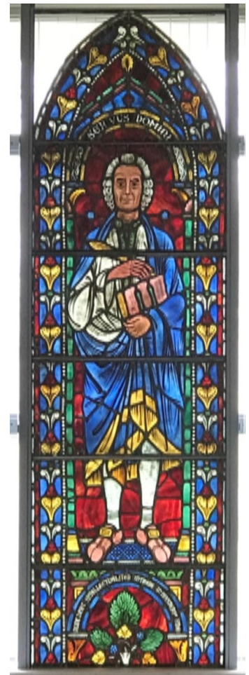
Stained glass portrait of Emanuel Swedenborg hanging in the Swedenborgiana Reading Room of the library.