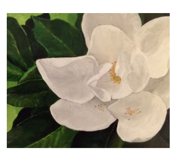
"Magnolias" by Debra Lermitte

The paintings will be on display in the Library until May 27.