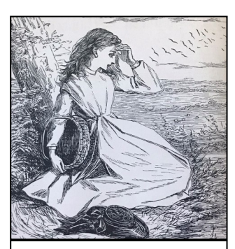
The Children's New Church Magazine Vol. XXX No. IV 1869

Students can stop by the library and take home printed pages and boxes of colored pencils to take a creative break from studying!